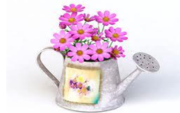
The C.I.B. Committee